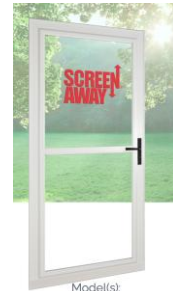
Model(s): 146FV 146FVE

Option A: Full View White with Screen Away retractable screen/glass.